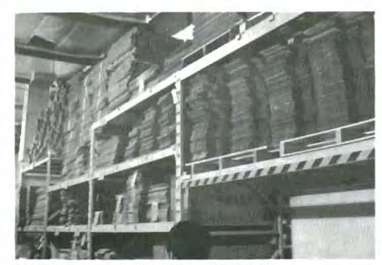
SHIPPING AND PACKING MATERIAL WAREHOUSE