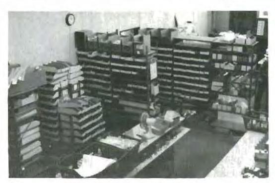
GMP'S EXTENSIVE PARTS DEPARTMENT MAINTAINS A $500,000 INVENTORY OF PARTS FOR ALL GMP AND HIROBO HELICOPTERS