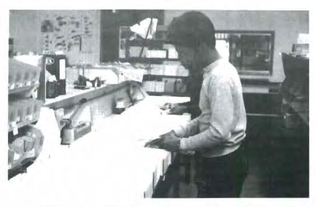
THE CRICKET PRODUCTION LINE - CRICKET IS THE WORLD'S MOST POPULAR .25 POWERED TRAINER/ SPORTS HELICOPTER