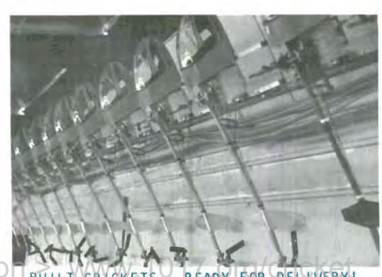
LUIS ESPINOZAS COMPETITOR PRODUCTION VINE, CRICKET CONNECTION BUILT CRICKETS - READY FOR DELIVERY!