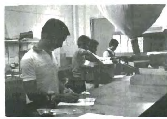
SHIPPING CREW AT MAIN GMP PLANT