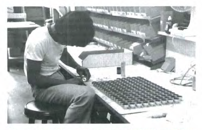
ALL OUR CLUTCH BELLS ARE TESTED AFTER ASSEMBLY BEFORE GOING INTO KITS