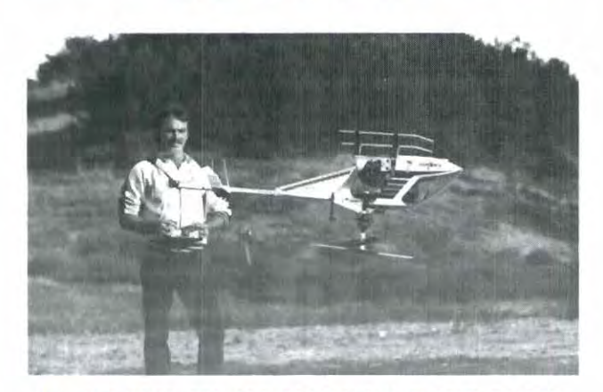
ALL GMP PRODUCTS ARE RIGOROUSLY FLIGHT TESTED AT OUR FLYING FIELD - HERE'S COBRA BEING CHECKED OUT