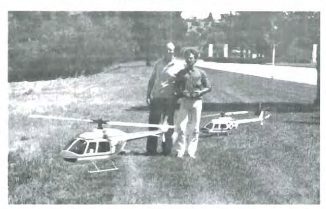
ANY NEW IMPORT KIT ADDITION TO OUR PRODUCT LINE WILL BE INTENSIVELY TESTED TO SEE IF IT MEETS OUR STANDARDS. IF NOT, WE WILL NOT CARRY IT.