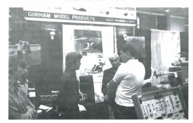
WE HAVE LARGE BOOTHS AT SIX MAJOR TRADE SHOWS -NEW YORK, SEATTLE, CHICAGO, LOS ANGELES, DALLAS. SEE US THERE.